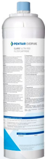
Head sold separately.

CLARIS ULTRA 1500 FILTER CARTRIDGE: 4339-83